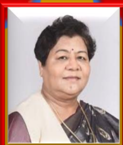
Sushree Anusuiya Uikey Governor of Chhattisgarh